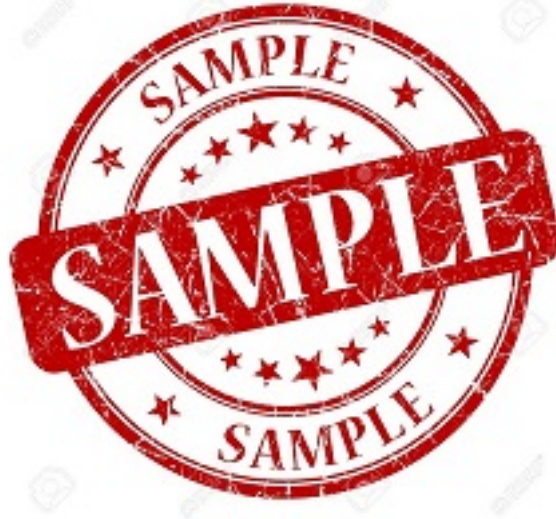
Figure 3-1: Sample Diagram 1

“References” tab and select “Figure” in the dropdown list. Click “Update Table” to update the List of Figures.