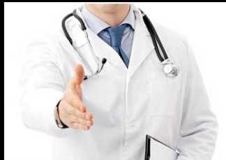
What my parents think I do