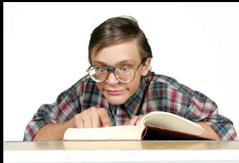
What my friends think I do