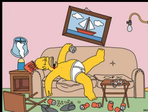
What my boss thinks I do