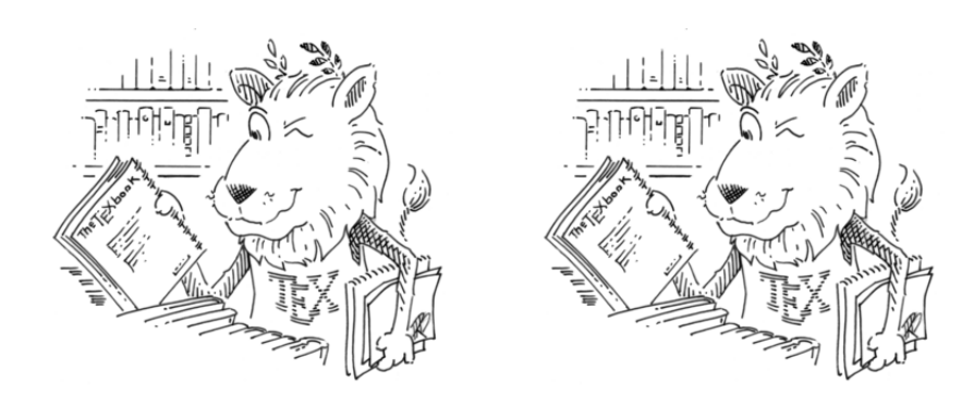
Fig. 2.3: Example of Two Pictures, One Next to the Other.