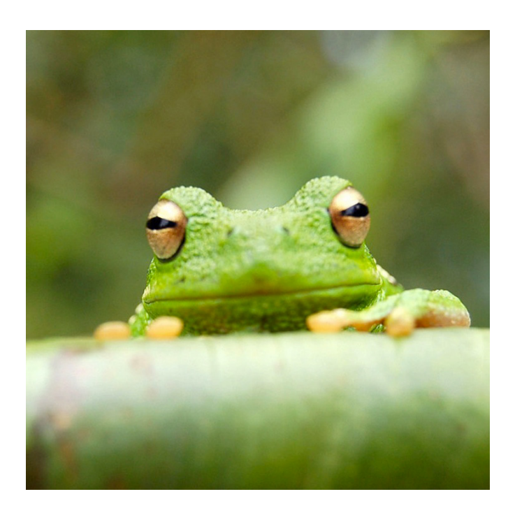
Figure 1: This frog was uploaded via the project menu.

see a 'BibTeX' link. Click on that, and you can copy and paste the code into your references.bib file. Here's a video to help you along: https://www.overleaf.com/help/97