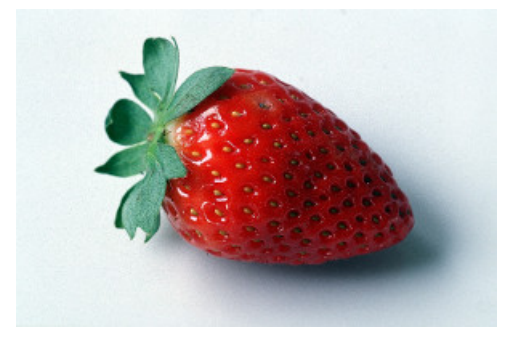
Figure 1: An example reference image.

In this section you should introduce the shader effect you're trying to recreate. You should include a few examples of real reference images which you are trying to simulate, such as in Figure 1. You must also decompose the chosen effect into individual layers or effects which you are going to try to implement.