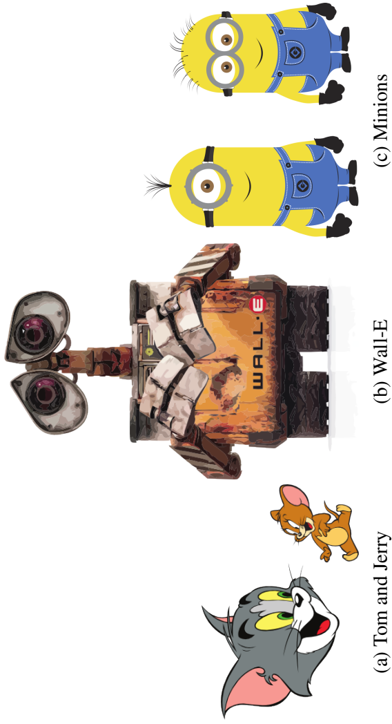
Fig. 2.2 Best Animations