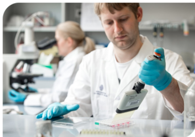
Figure 1: Caption goes here.