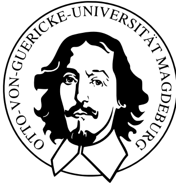
Figure: Logo of the university.