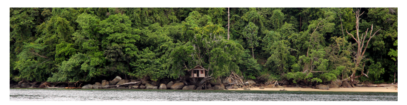
FIGURE 2. Example figure caption for a double-column image. Images that are wider than they are tall might be more readable as double-column figures, whereas tall images will likely take up too much page space.